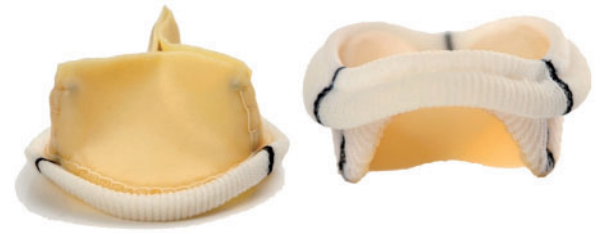
Figure 2: Dokimos Plus bioprosthesis

All patients were routinely evaluated pre- and postoperatively using TTE performed according to the guidelines of the European Association of Cardiovascular Imaging and the American Society of Echocardiography (ASE) [8]. TTE measurements performed at rest included transvalvular flow velocity with continuous-wave Doppler scanning and left ventricular outflow tract (LVOT) flow velocity with pulse-wave Doppler scanning. LVOT diameter was assessed from a